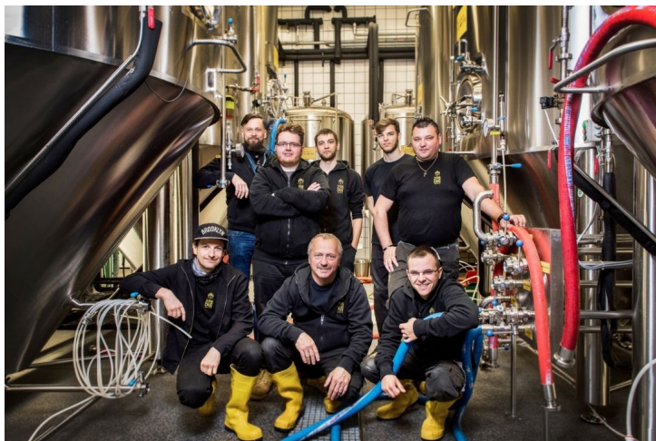
The Team

The team at Trzech Kumpli has many ideas they are working towards, from easy, everyday beers, to stronger ones and those aged in oak barrels. But most importantly, their focus is on building their own brewery in Tarnów, Mościce district, where their shop is located.