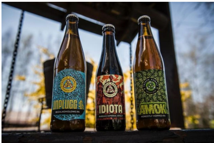
Trzech Kumpli Beers

The team of 16 brews over 55 beers ranging from classics like award-winning Porter Baltycki, sour brews like the Imperial Berliner Weisse With Raspberries, alcohol-free beers like the IPA Unplugged, and many more.