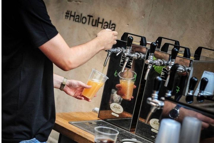
Trzech Kumpli beers on tap at Wezze Krafta bar, source: Facebook

Trzech Kumpli's Porter Baltycki, with a commanding flavor of licorice and the warmth of the chocolate and caramel, won over judges and redefined the essence of a true Baltic Porter. The moderate bitterness of the Polish hops and a mild touch of sweetness from the molasses delivered the needed zing to name this beer a winner.